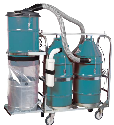
DUST EATER BEAST CS PACKAGE