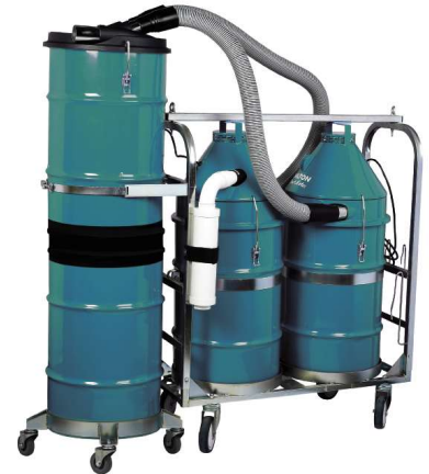
DUST EATER BEAST CS AUTO DUMP PACKAGE

1 Requires 2 Dust Eater Units. Dumper in Bag or Skip configuration, * possible with Skip option only.