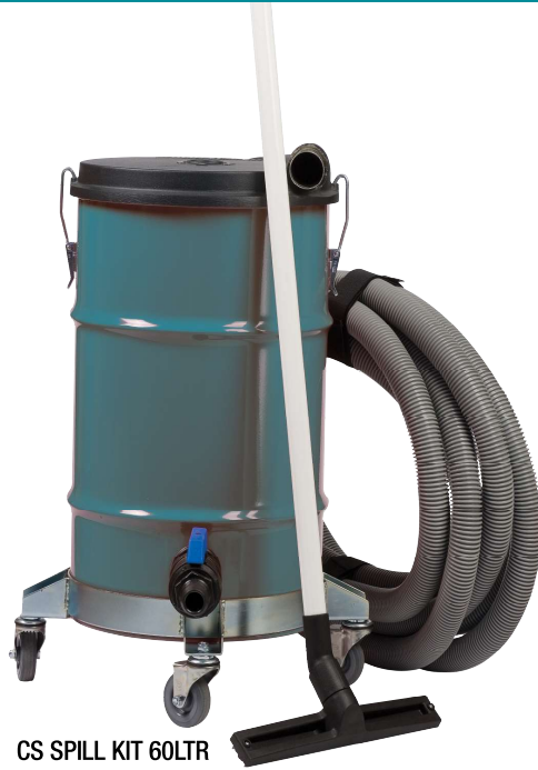
CS SPILL KIT 60LTR