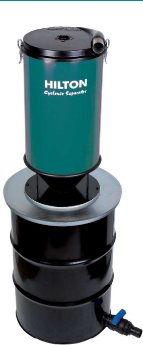
CS FULL EXTENSION 200/210ltr Option pictured