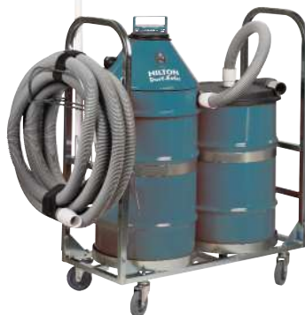
DUST EATER CS DOUBLE UNIT