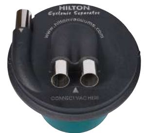
CS HEAD CONFIGURATIONS